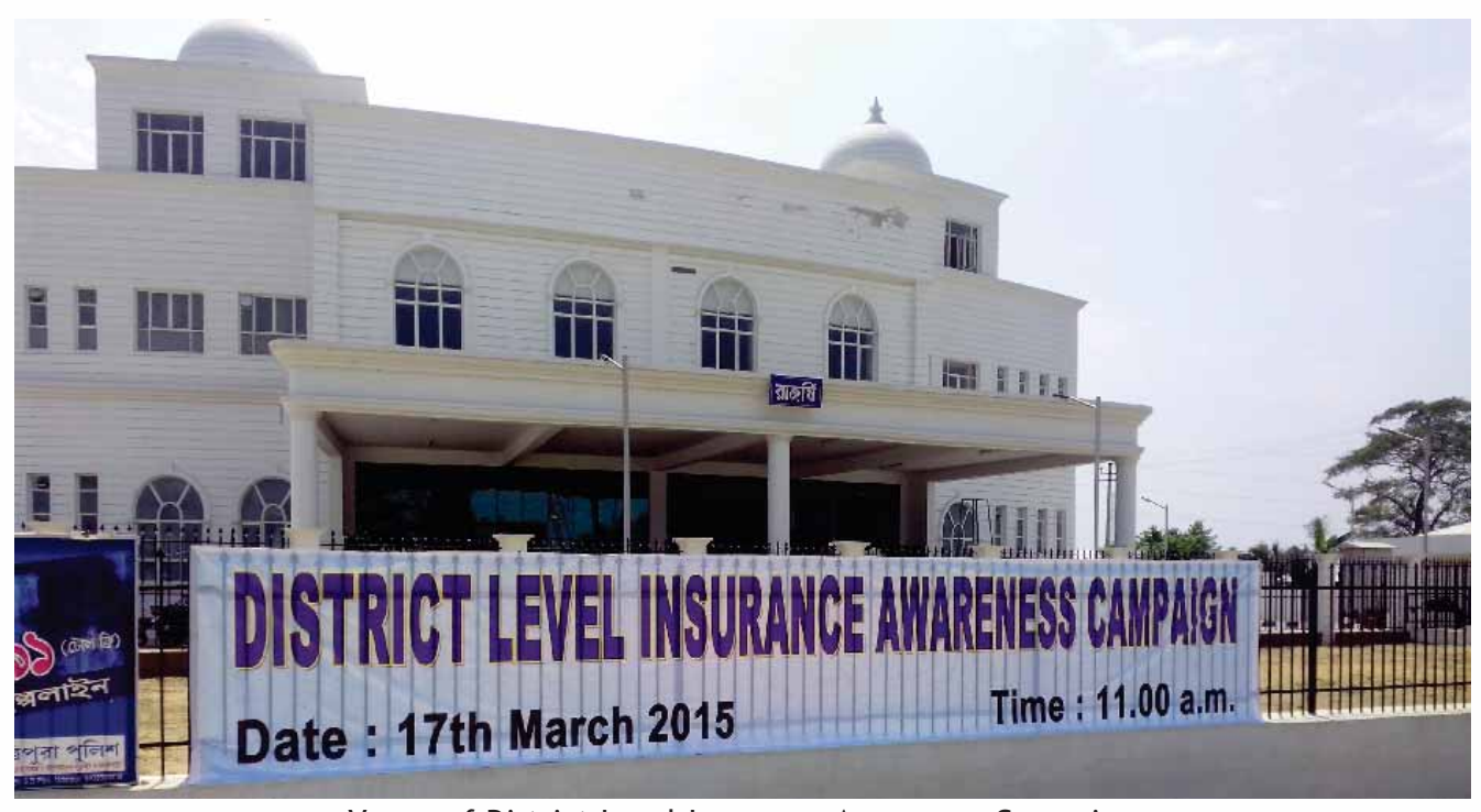
Venue of District Level Insurance Awareness Campaign in Tripura, held on 17th March 2015.

IRDAI has adopted Tripura State of North Eastern Region with a mission to achieve complete insurance awareness and total insurance inclusion. As a part of this campaign, seminars are being conducted in each district. So far, district seminars were organized in four districts viz. Sipahijala, Khowai, North Tripura and Gomati districts. There is overwhelming response from the local residents appreciating the initiative.