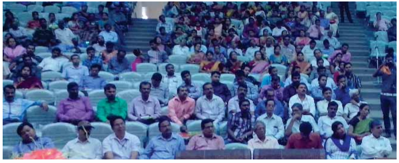
Participants of District Level Insurance Awareness Campaign in Tripura, held on 17th March 2015