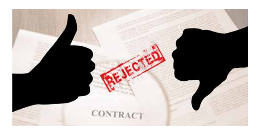
Claim Repudiation in Insurance